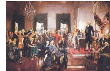
The Preamble to the United States Constitution (September 17, 1787)

▶ “Delivering America’s Promise to All Americans — NOW!” Intro session, Skype-Right-In Ys-Rap Q&A; 60 minutes (may run over); $24/person; to 48 participants; includes Playbook. (see our PayPal “Pay Master” Page)